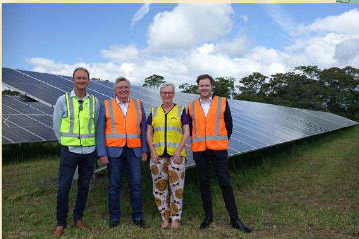
Photo (left to right):